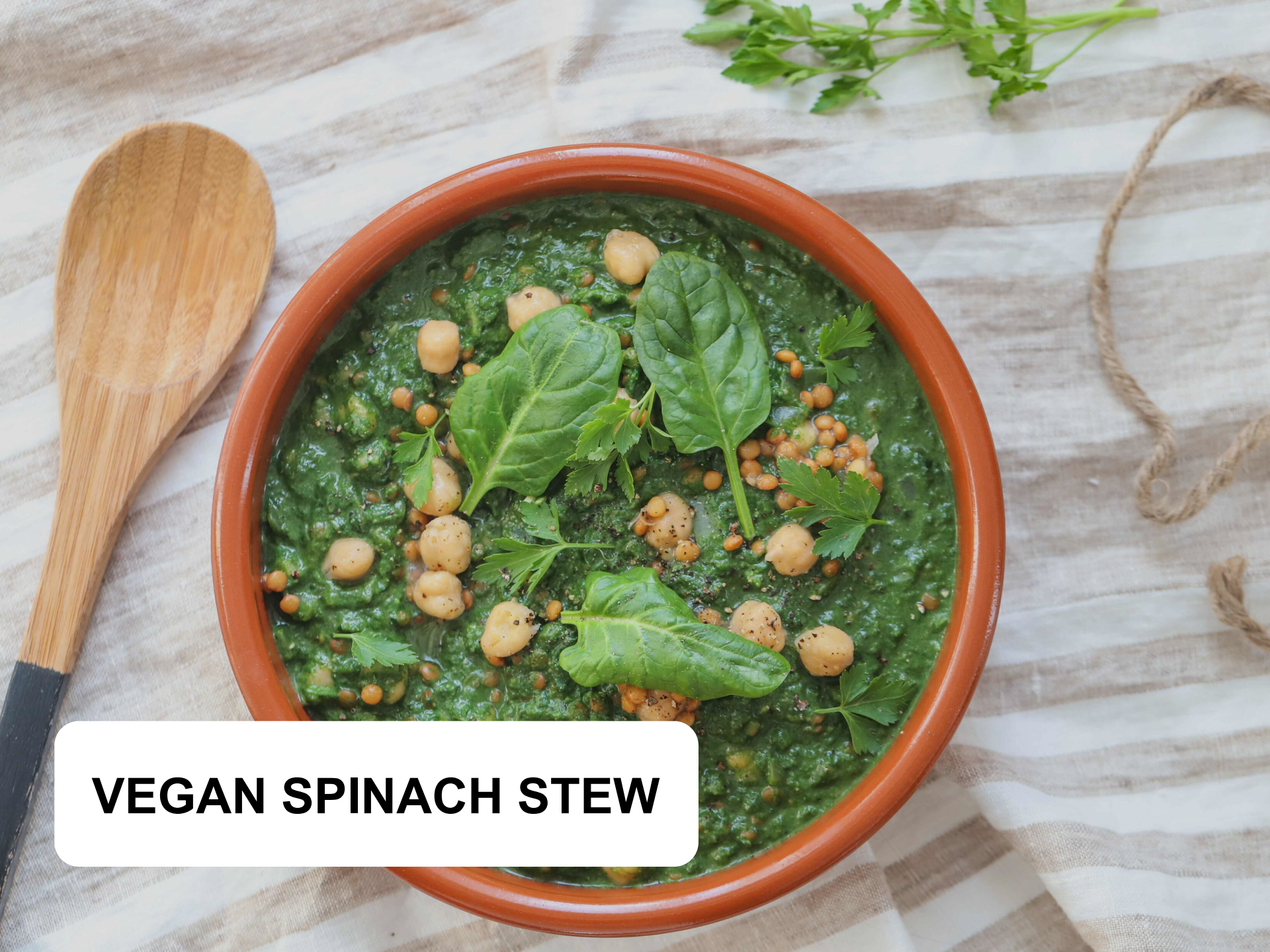
VEGAN SPINACH STEW