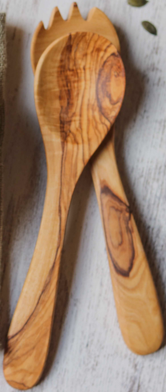
ROASTED ROOT VEG SALAD WITH FETA