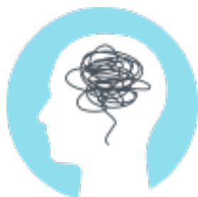
Difficulty making decisions