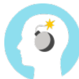
Inability to cope with stress