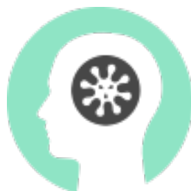
Frequent colds and infections