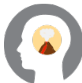
Moodiness and irritability