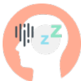
Lack of motivation