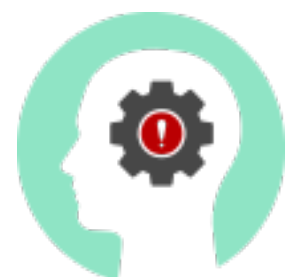
Impaired motor skills & increased risk of accidents