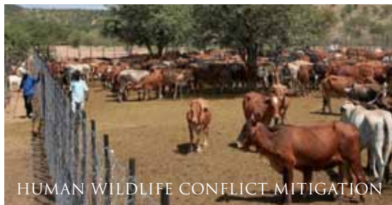
HUMAN WILDLIFE CONFLICT MITIGATION