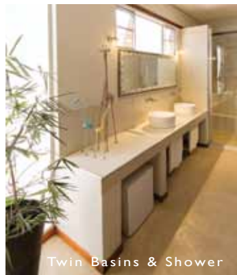
Twin Basins & Shower