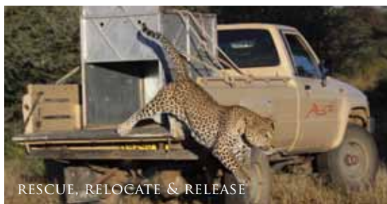
RESCUE, RELOCATE & RELEASE